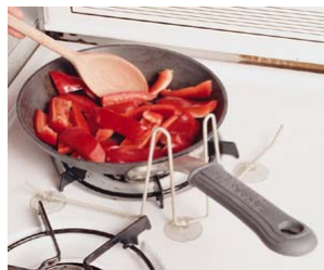
Pot and Pan Holder

Tech Connections is a collaborative project of the United Cerebral Palsy Associations, the Center for Assistive Technology and Environmental Access (formerly CRT) at the Georgia Institute of Technology, and the Southeast Disability and Business Technical Assistance Center.