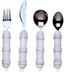
Large handle utensils