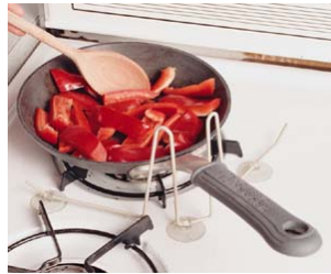
Pot and Pan Holder