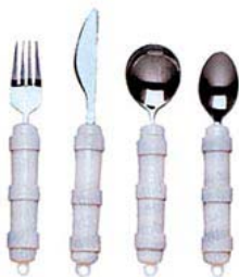
Large handle utensils